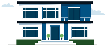
Renting temporary housing