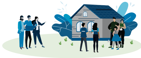
Repairing uninsured or underinsured homes